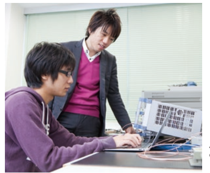
A discussion referencing collected data