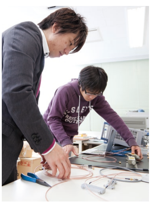
An experiment at our laboratory

One of our goals is to make anytime/anywhere connectivity for mobile phones and wireless communication equipment a cornerstone of future social infrastructures. Once this goal is attained, the familiar indications of signal strength on mobile phone screens will be rendered obsolete. Now, mobile phones and wireless communication equipment are currently viewed