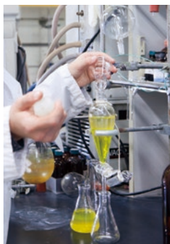
Precipitating the luciferin