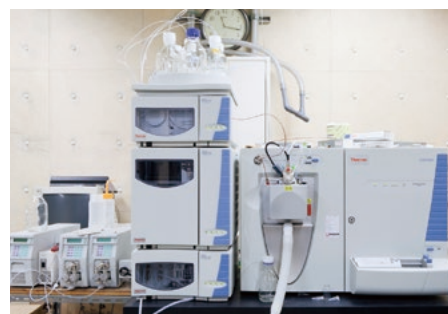
High-performance liquid chromatograph (HPLC) system

With growing expectations for regenerative medicine in Japan and based on technological development studies of iPS cells, we plan to promote Aka Lumine®, introduced as a commercial product with support from the University of Electro-Communications, to pave the way to elucidating the processes involved in carcinogenesis, tumor growth, and metastasis, thereby helping Japan become a world leader in the field of oncology. To achieve this goal, we hope to innovate multi-color luciferin offering even higher performance (higher luminous intensity and sensitivity) and the associated devices and materials need for effective bio-imaging.