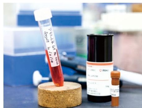
Aka Lumine®, a bio-imaging probe that exhibits the world’s longest luminescence wavelength

This technology converts long light wavelengths to innovate emission in the three primary RGB colors (red: 675 nm; green: 560 nm; blue: 450 nm). We have also developed a way to change the wavelength in steps of 30 nm and a technology for enhancing luminescent activity.